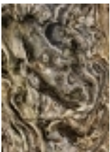
Mr. Punch? £15.00

Mosaic. How can nature make such a beautiful object? [Product Details...]