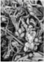
Frost on seaweed £15.00

We tend not to associate frost with seaweed, but it makes a striking composition. [Product Details...]