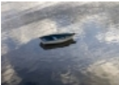
Lone boat £15.00

Lifebelt. No matter what the weather or state of the structure it is nice to know that the lifebelt and rope are always ready for action. [Product Details...]