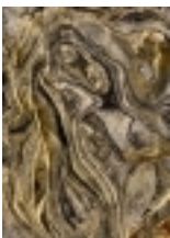
E.T. meets the frog? £15.00

Taken in the Cheviot Hills. How long has this tree stood up to the battering of the westerly winds and how does it still stand? [Product Details...]