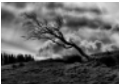
Against the elements £15.00

The white suggests purity whilst the brown is an unwanted addition. The speed, direction of flow and combined colours form a striking design. [Product Details...]