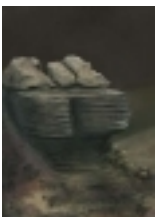
Simonside Rock £15.00

Watercolour. Approaching the end of the Pilgrims' causeway which crosses the sands to Holy Island. [Product Details...]