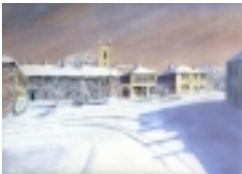
Belford at Christmas £15.00

Watercolour. 'Belford at Christmas'. The Blue Bell Hotel is the centre of our village. Trying to photograph it with no traffic is almost impossible. So paint it! [Product Details...]