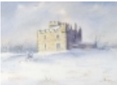
West Hall Belford

Watercolour. This mysterious valley drains water from the western side of The Cheviot into the College Burn and the fantastic College Valley.. [Product Details...]