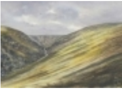
The Hen Hole Cheviot Hills

Pastel. "The Bizzle" This dark and forbidding place consists of the Bizzle Craggs and the Bizzle Burn draining off the north side of The Cheviot. On the top are remains of two World War 2 crashed aircraft. [Product Details...]