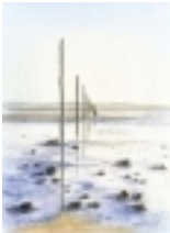
End of the Pilgrimage £15.00

Watercolour. 'Belford at Christmas'. The Blue Bell Hotel is the centre of our village. Trying to photograph it with no traffic is almost impossible. So paint it! [Product Details...]