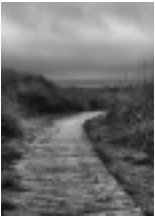
Path to the sea £15.00

Lost in time. Buried in the reeds, did someone forget about it? [Product Details...]