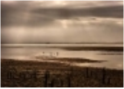
Looking for shellfish Lindisfarne £15.00

Looking for shellfish Lindisfarne. As the tide recedes the rock pools reveal their food store. Almost sepia-like, this view is taken from Holy Island with Bamburgh Castle in the distance [Product Details...]