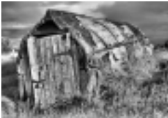
Fishermen's hut Holy Island £15.00

Holy Island is famous for the fishermen's huts recycled from redundant boats. [Product Details...]