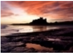
Early light Bamburgh £15.00

The majestic Bamburgh Castle in silhouette with a beautiful coloured sky reflected on the rocks.