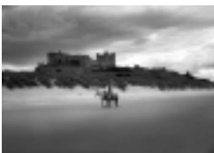
Horse riders Bamburgh Castle £15.00

Holy Island is famous for the fishermen's huts recycled from redundant boats. [Product Details...]