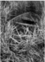
Lost in time £15.00

Looking for shellfish Lindisfarne. As the tide recedes the rock pools reveal their food store. Almost sepia-like, this view is taken from Holy Island with Bamburgh Castle in the distance [Product Details...]