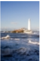
St. Marys Lighthouse £15.00

Path to the sea. The heavy sky and the deserted path leading to the beach suggests there will be solitude on the beach. [Product Details...]